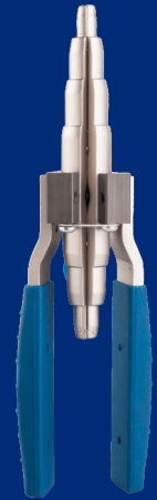
Foldable, easy to carry