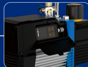
Vacuum Gauge Compartment